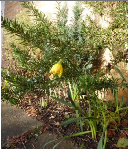
Can it be? The first of our autumn planted bulbs breaks cover.