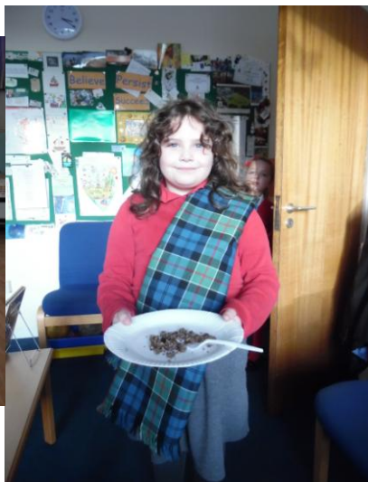
The Puffins cooked some Haggis to taste as they continued their learning about Scotland.