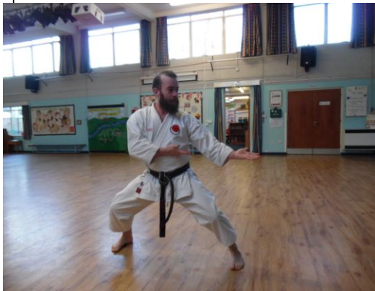
The children participated in karate taster sessions delivered by ESKA (Eastern Shotokan Karate Association).