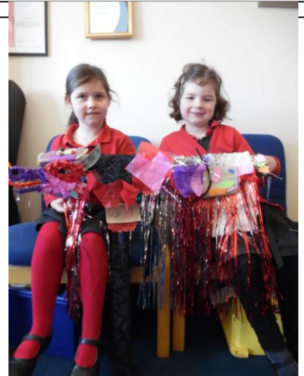
The Penguins have been making some colourful dragons in preparation for the Chinese New Year.