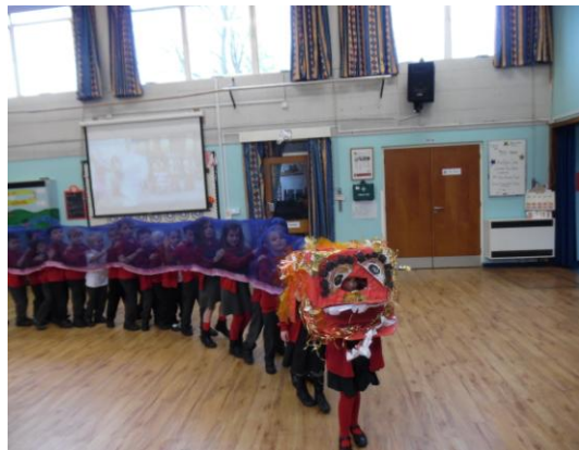
The Penguins were transformed into a dancing dragon.