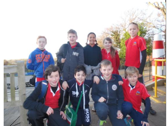
Our Year 6 Tag Rugby team are on their way to the UEA to compete with other local schools.