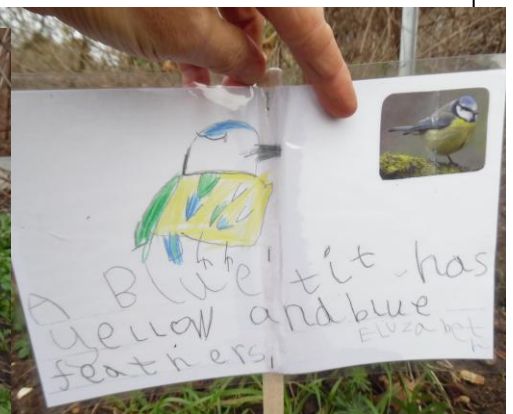
Thank you, Swans, for some beautiful and informative signs in the school grounds to help with our birdwatching.