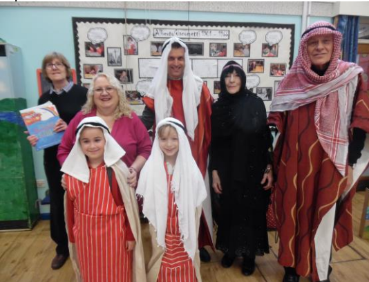
We welcomed the Open the Book team for a story about Abraham and God this week at assembly.