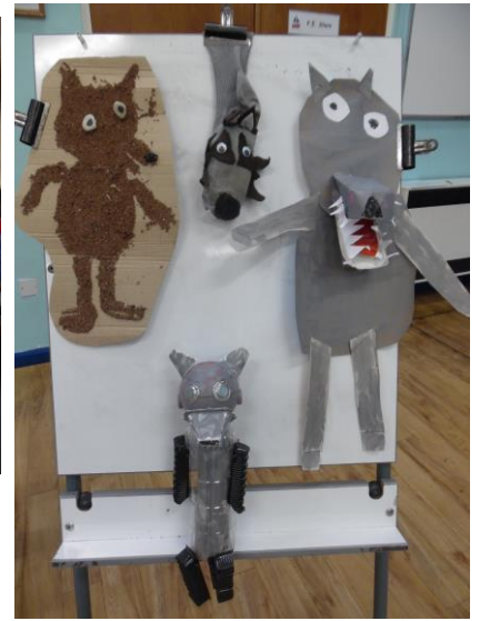
We loved the Penguins assembly on homes.