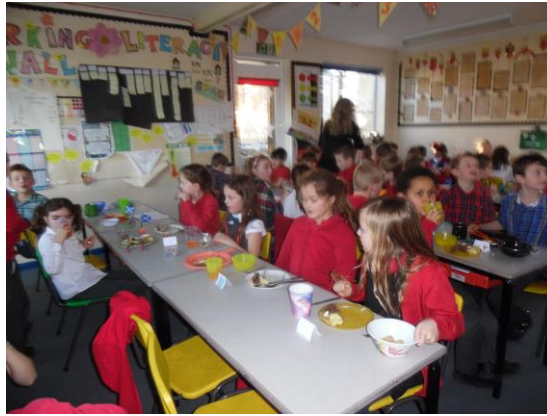
Burns Celebrations...Great haggis and veggie haggis.