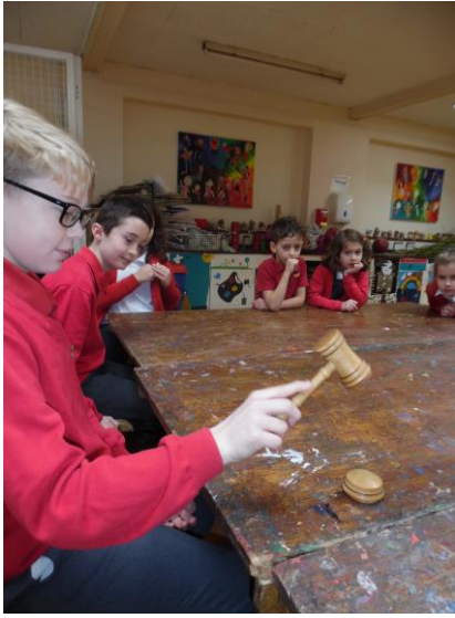
Pupil Council met on Friday to begin thinking about how we can reduce paper waste in the school.