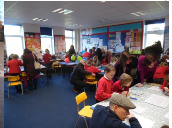
Good to welcome so many parents to the Nightingales parent share.