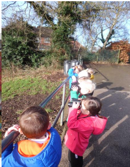
Penguin birdwatchers out in force this week-or should that be birdwatchers from the Penguin class?