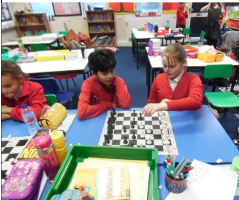
Hérons v. Swift in an inter-house competition this lunchtime.