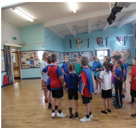
Fitness continuing with the Puffins figuring out Bench Ball rules.