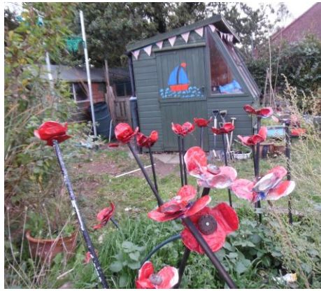
The poppies created by the metal-working team have weathered well. We are looking forward to being involved with the community over the coming centenary events.