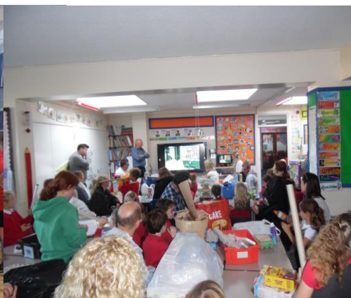
The Toucans hosted their first Parent Share of the year and produced some amazing robots.