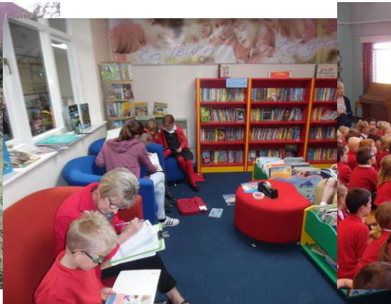
The Library is getting more and more use every day.